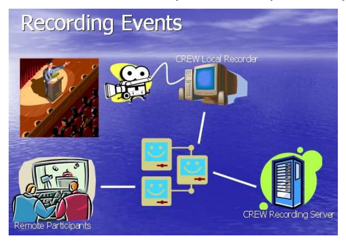
Figure 2. Recording events usage scenario visualization

The first of these activities comprised of user requirements sessions, so-called User Days, which have been held with each of the three user groups. The findings have been compiled within the CREW User Requirements Report (cf. Poschen, 2007). Each event lasted about four hours with 4-5 users participating and included an introduction to the project together with a description of development plans as well as an interactive session to understand users' needs, specific requirements and likely usage scenarios. The intended outcomes of the day were for users to understand what CREW is about and for the development team to understand what users really need. Additionally a questionnaire, devised by the Oxford e-Social Science node<sup>12</sup> considered legal, social and ethical issues that may result from use of CREW was distributed at these events; the analysis is currently under way.