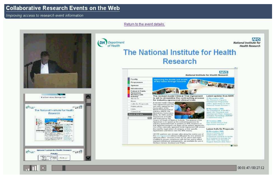
Figure 1. Example of a prototype (pilot release 1) of the CREW replay application

overview on the left and the actual slide in the main view – is configurable in the editing process and can be presented differently in the progress of the event. The slide overview then might show thumbnails of questions and answers to jump to, with the main window showing the speaker or the audience. The control elements in the bottom bar provide functionality to control the recording (loudness, play/pause, position bar, elapsed time, total time).